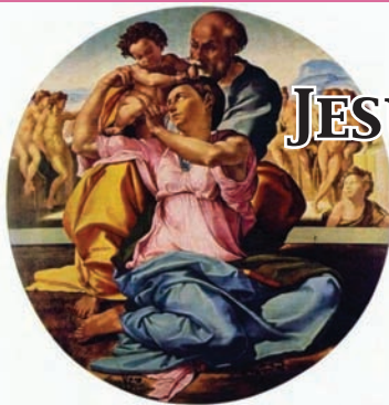
The Doni Tondo (Michelangelo)

My eyes have seen your salvation, which you prepared in sight of all the peoples. LUKE 2: 22-40