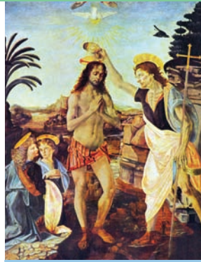
The Baptism of Christ -- Verrocchio