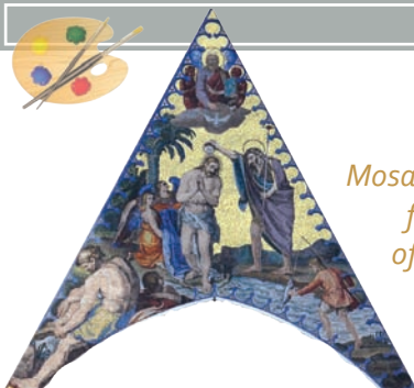
Mosaic of the Baptism of Jesus, from the West Facade of the Orvieto Cathedral